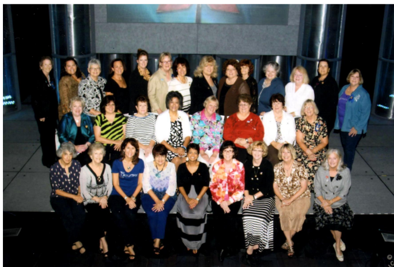
Above photo: Not all SPR attendees were able to make the photo shoot.

SIA 43rd Biennial Convention, Vancouver, Canada July 23-26, 2014